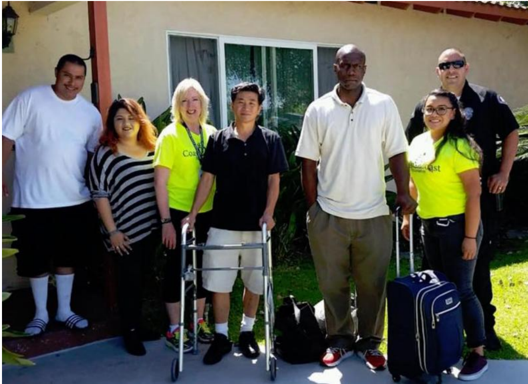
JooJoo at his new home with Coast to Coast Foundation staff, an Anaheim PD officer, and his IF Case Manager.