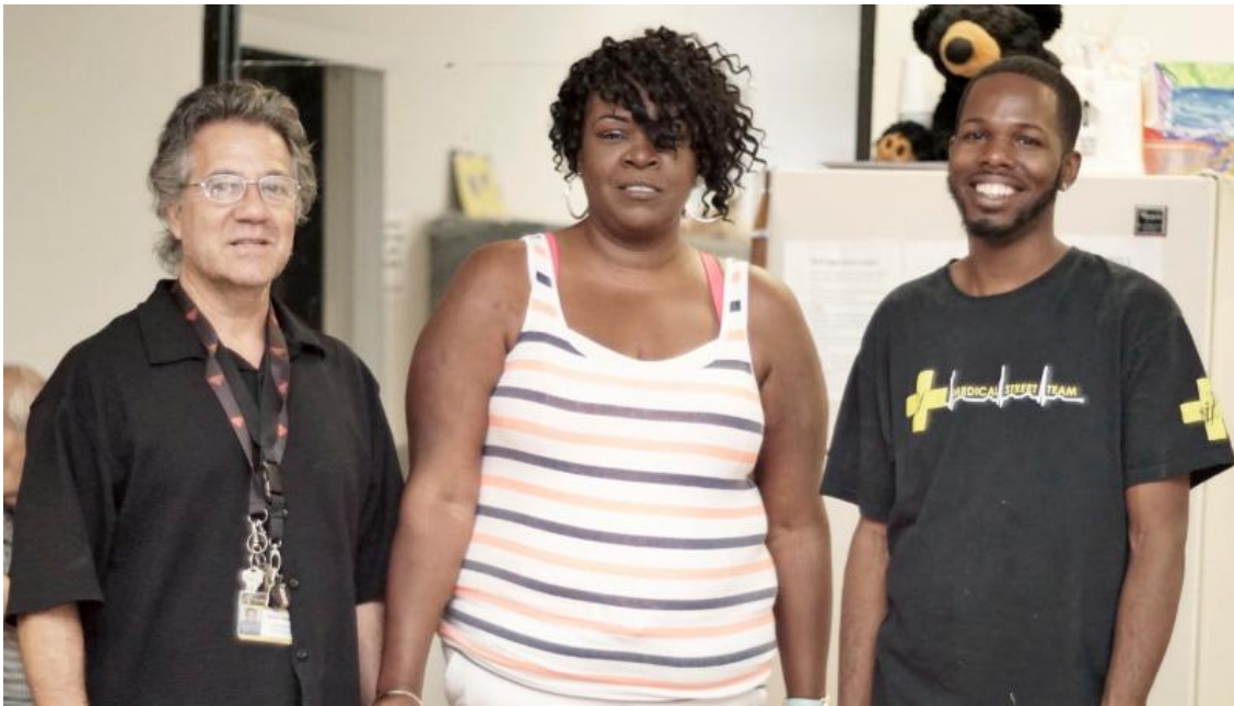
IF Recup Staff with a client.